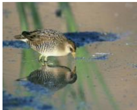
Sora at Tule Lake NWR