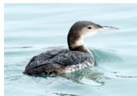
Common Loon, Non-breeding