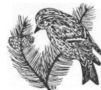
Pine Siskin

Siskiyou Audubon Society is Independent Chapter No. T61 Affiliated with National Audubon Society, www.audubon.org