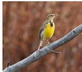
Western Meadowlark Nestucca Bay NWR USFWS