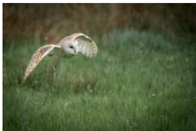
Barn Owl