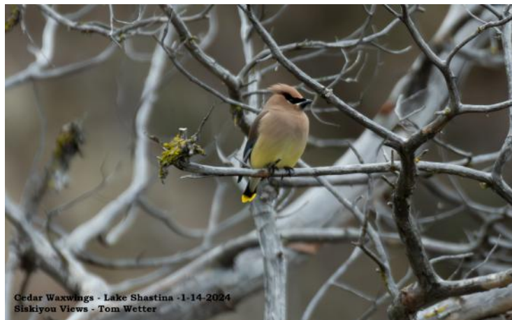
Cedar Waxwing at Lake Shastina