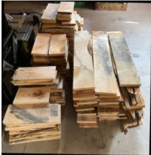
Donated Wood in Storage